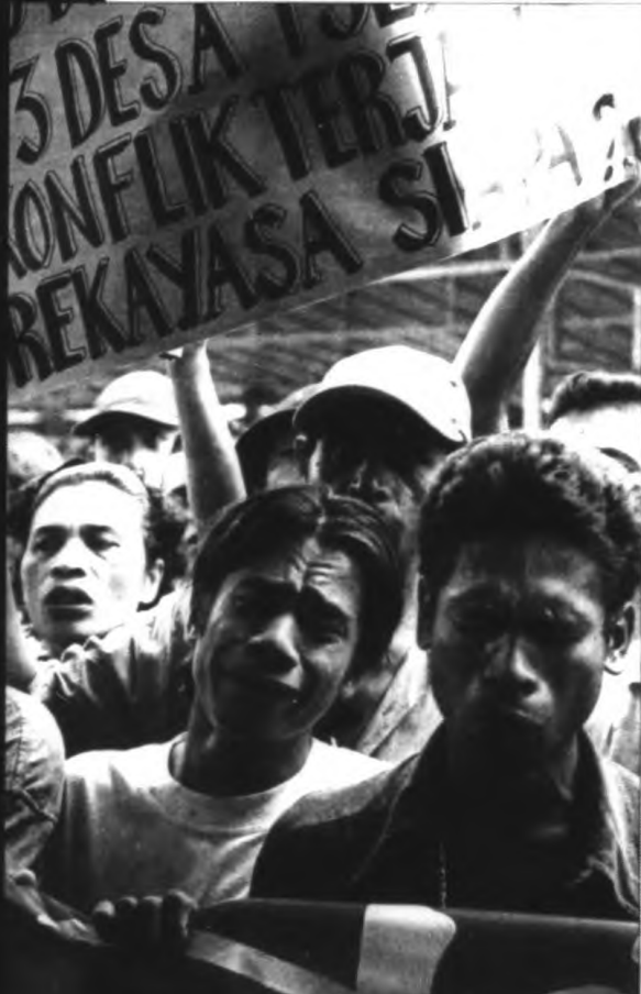
CRY OF THE PEOPLE —Christian demonstrators protest outside the provincial governor's office in Ambon City, Indonesia. They want to know why the government offers them no protection from deadly attacks by well-equipped Muslim "jihad" warriors, backed by elements of the Indonesian military.