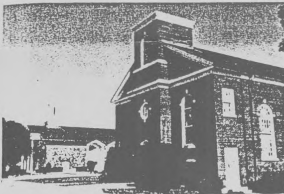
Construction completed in 1950