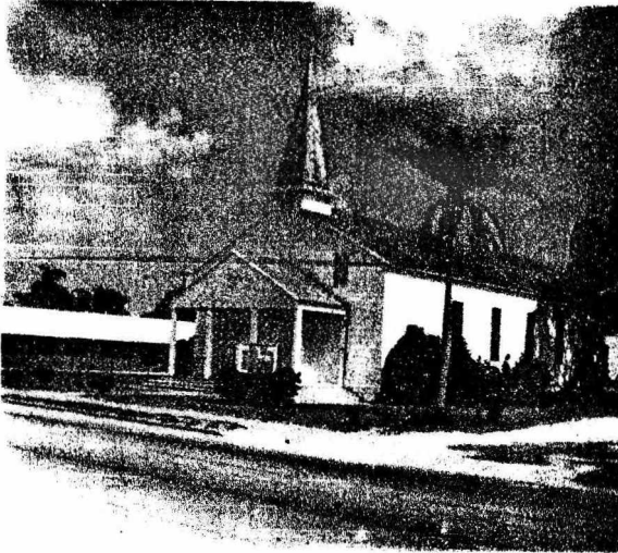
WESTSIDE BAPTIST CHURCH