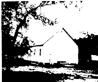
SALEM BAPTIST CHURCH

God has blessed the Church in many ways over the years, but the greatest blessing is the many people who have come to know Jesus Christ as Lord and Saviour through the ministry of the Church.