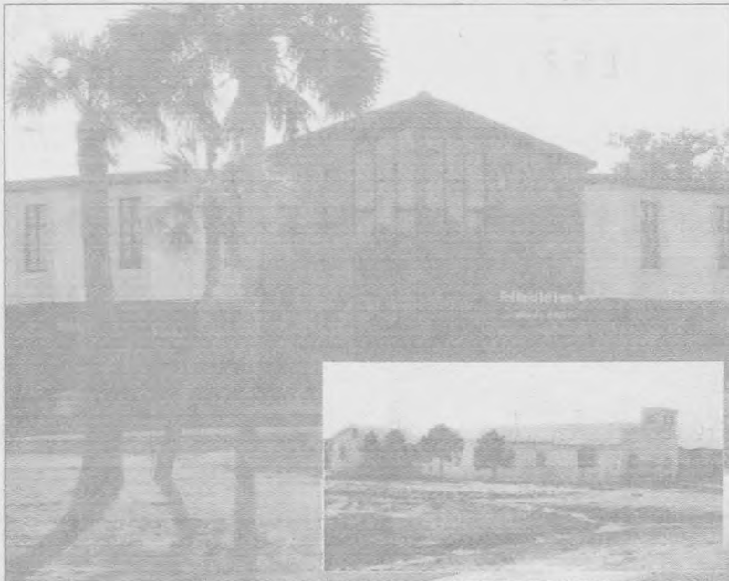
First Baptist Church will be celebrating its 50th birthday this Sunday, Jan. 21.