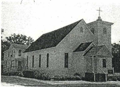
First Baptist Church, located in the old Alger-Sullivan Historical District

The congregation continues to worship in the original building, which has been renovated and improved in recent years. A Bible teaching program, Church