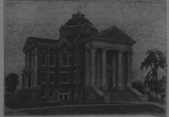
LAKE WALES BAPTIST CHURCH Lake Wales, Florida