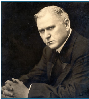
George W. Truett: Christ or Chaos