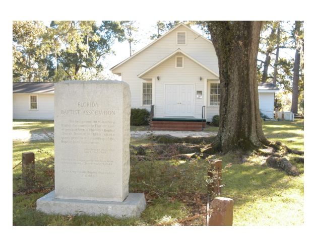
Ebenezer Baptist Church, Jefferson County

The letter reported on the agreement by representatives from six Florida churches formerly affiliated with either the Georgia-based Ochlocknee Association or the Florida-based Suwannee River Association, as well as other interested pastors, who wanted to organize a pro-missionary association. The information meeting – held October 22, 1842, at Leon County's Shilo [sic] Baptist Church – resulted in the several representatives endorsing the formation of a new Florida-based association of Baptist churches. Now 175 years later, the Florida Baptist Association holds the distinction of the being oldest continuously functioning missionary Baptist association in Florida.