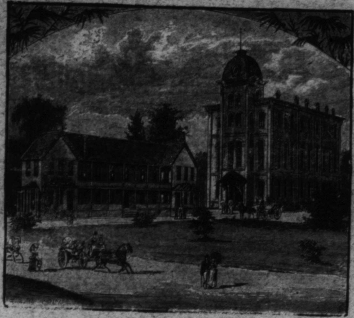
MAIN BUILDING AND ONE OF THE DORMITORIES

In the Main Building there are the offices of the President and of the Financial Secretary, Y. M. C. A. Hall, Stenographer's Department and one floor for the Business School, also a large Auditorium and Gallery capable of seating one thousand persons.