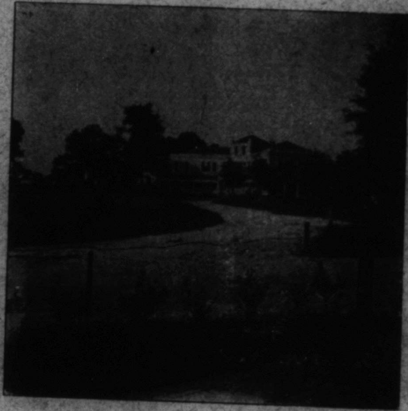
DRIVEWAY THROUGH GROUNDS, COLUMBIA COLLEGE.

The entrance to the Campus is a beautiful driveway shaded by magnificent oaks and hedged with camphor trees and palms. It passes near the Young Men's Dormitory, a splendid three-story brick building, warmed by steam and lighted by electricity, and supplied with water, toilets and bath-rooms on each floor.