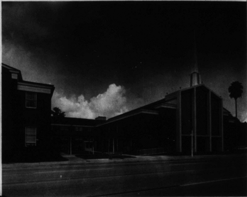
Shown above is the College Park Baptist Church, Orlando, Florida, where the Ninety-Fourth Session was conducted.