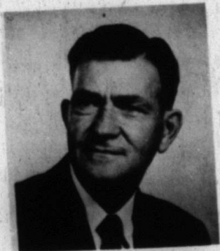
W. L. Lockler Miller Memorial Baptist Church