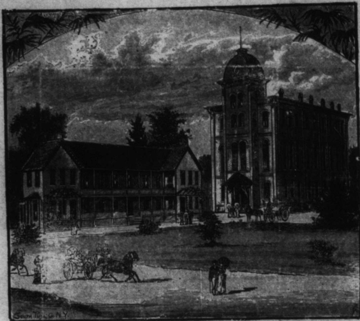
MAIN BUILDING AND ONE OF THE DORMITORIES

In the Main Building there are the offices of the President and of the Financial Secretary, Y. M. C. A. Hall, Stenographer's Department and one floor for the Business School, also a large Auditorium and Gallery capable of seating one thousand persons.