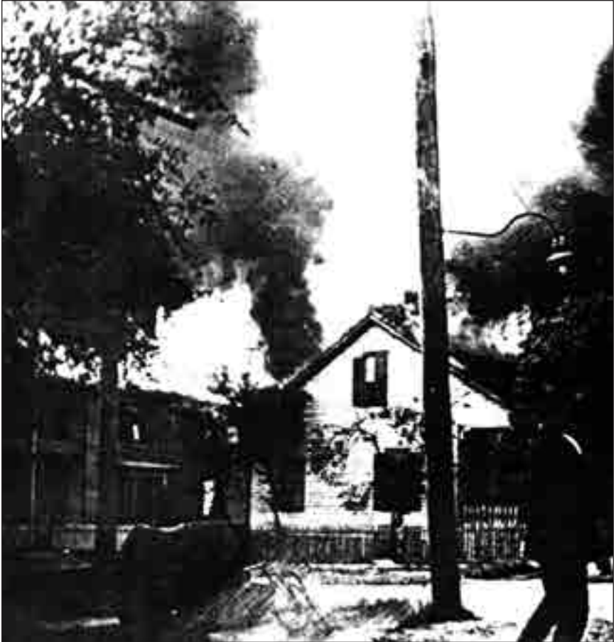
This burning house was one of hundreds that was lost that day.

and men were fighting the fire on north side of roof, with prospect of success, but I noticed that the south side of roof was on fire, and soon decided that it was beyond control; and that another swatch a block or more wide was doomed. I walked east on Monroe to Hogan and North on Hogan near the corner of the Park I saw Bro. G. E. Chase cross in