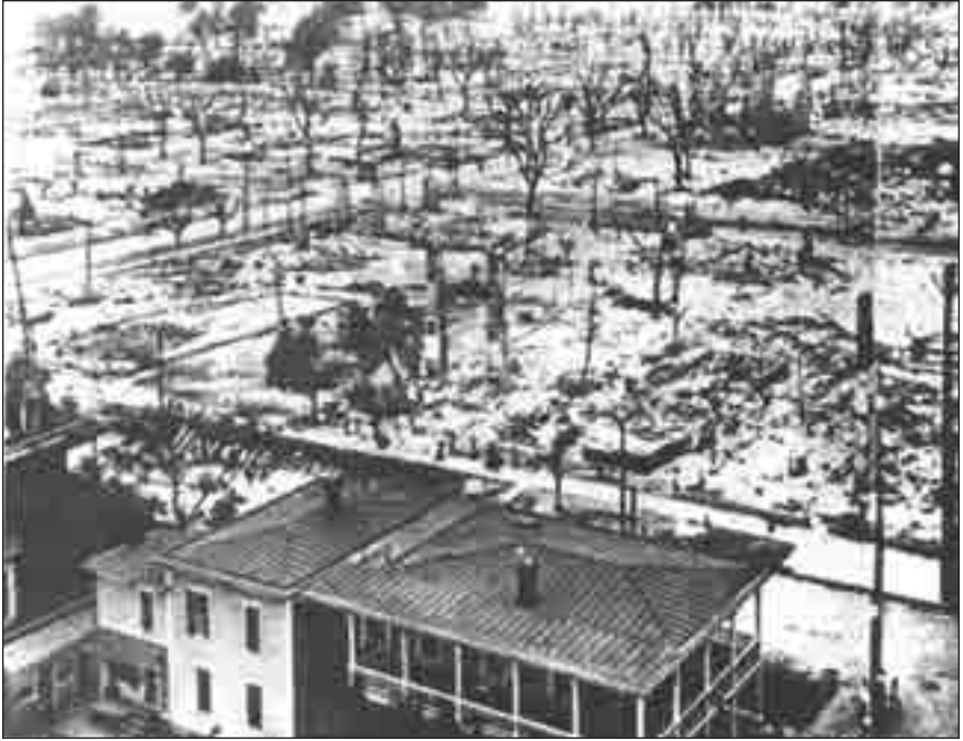
One scene of that terrible day