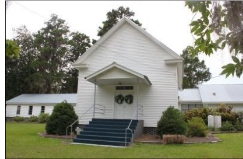
Concord Baptist Church, Madison

A man once said, “I don’t know anything about doctrine. All I know is God created the world, Christ died for me, and arose, and is coming again.” That theological position will do for a starter.