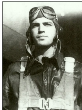
Colin P. Kelly