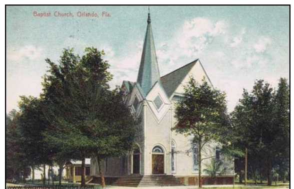
First Baptist Church, Orlando