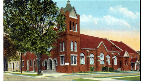
First Baptist Church, Lakeland