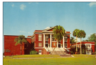
First Baptist Church, Ocala

In 1867, Basil Manly, Jr., wrote a letter to his children, explaining that his church had a decorated tree used in their Sunday School program and "inexpensive gifts were exchanged." ( Baptist Press , December 23, 2011).