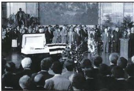
Memorial service at Capitol Rotunda