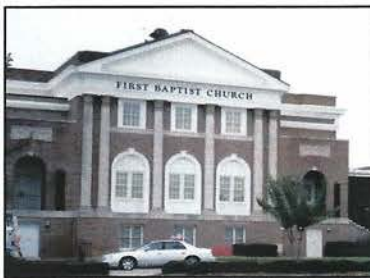
First Baptist Church, Dothan, Alabama