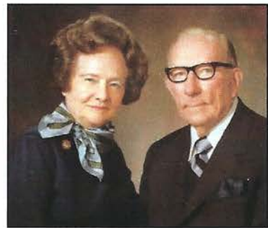
Claude and Mildred Pepper