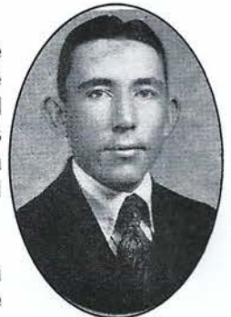
Claude Pepper

Pepper was a champion of the downtrodden and a friend of the poor. He fought injustice and helped those who were powerless and oppressed. He was a Baptist by conviction and claimed Central Baptist Church in Miami and First Baptist Church in Tallahassee as his Florida home churches. On March 30, 1944, the "Claude Pepper Club" of Duval County bought a full page ad in the Florida Baptist Witness , and showed a picture of Pepper and permitted him to share his basic political beliefs. Pepper stated, "The Scriptures tell us: We are our brother's keeper. If the nations and peoples of the world had followed the teaching of Christianity, we would not have world war. We would not have a large part of the world suffering. America was founded on Christian principles by Christian people. We believe that America has a dominant place in the divine plan for a better world...as Baptists we must try to build rightly for the right."