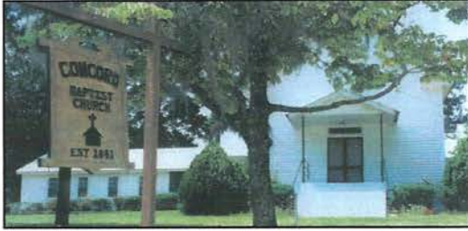
Concord Baptist Church

Concord (p.127). Walking around Concord Baptist church and grounds makes one feel that it is Baptist Smithsonian South. They have a grand heritage, a beautiful facility and a cemetery of Florida Baptist Who's who. In 2004, they were a major host for our 150 th Anniversary of Florida Baptist work.