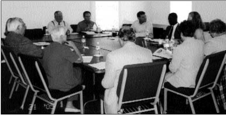
Board of Directors in session, April 21, 2005.