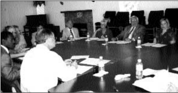
Board of Directors