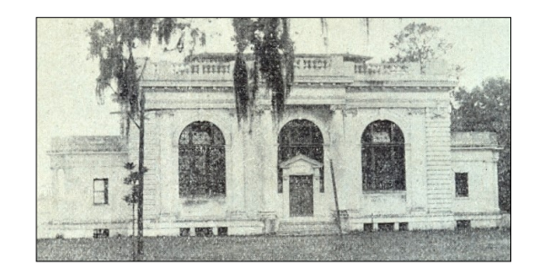
Columbia College Gymnasium