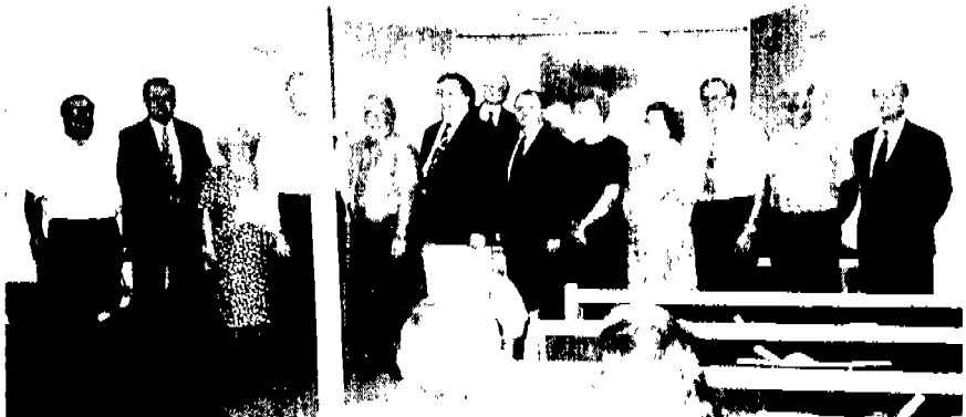
Associational Officers 1998-99 being recognized October 20, 1998.