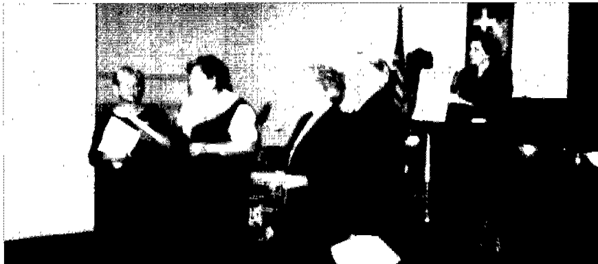
"Carry the Light-Follow Christ's Example" theme interpretation given by the ASSISTeam.