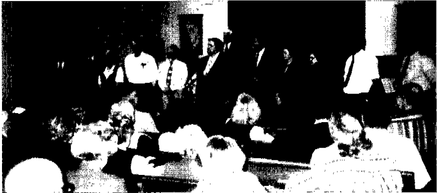
Associational Officers 1997-98 being recognized October 21, 1997