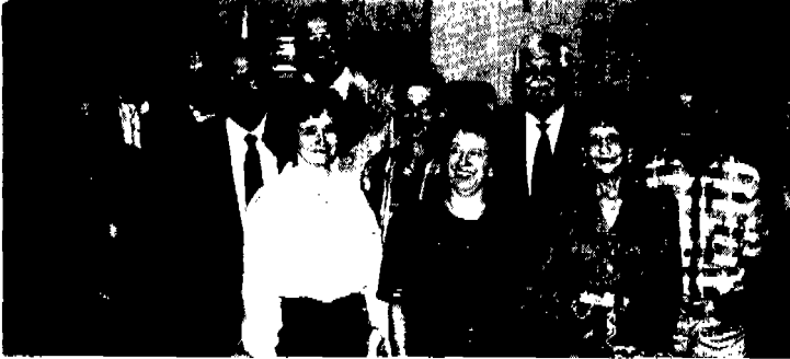
Members of Olive Baptist Church welcomed into Association 18 October, 1994