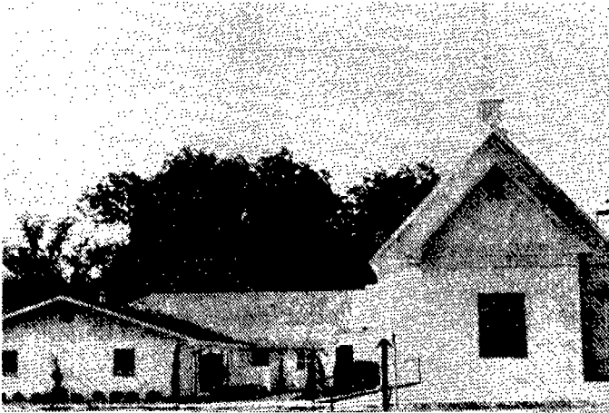
Mayo Baptist Church