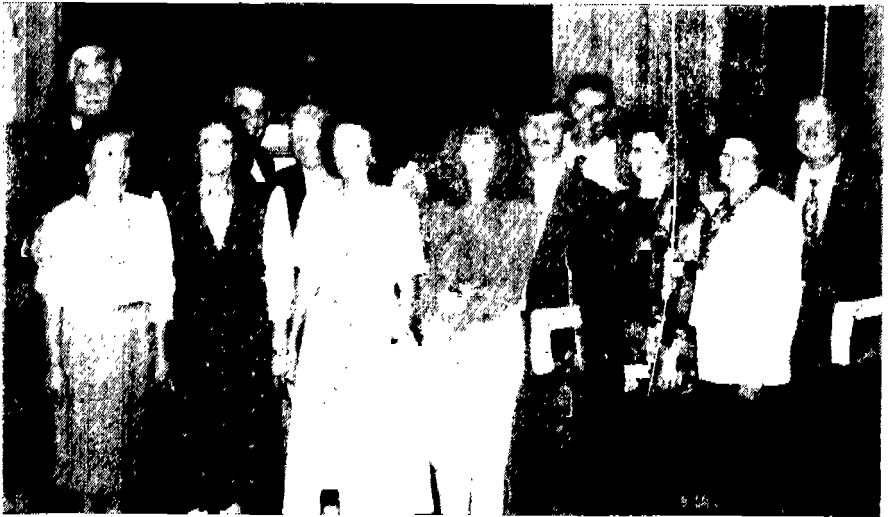
Olive Baptist Church, Boston, Georgia, being welcomed into the Association, October 11, 1993.