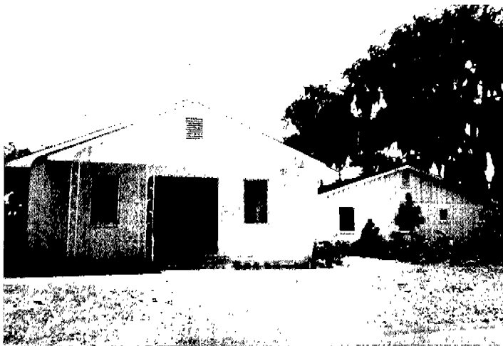
Pine Grove Baptist Church 1974