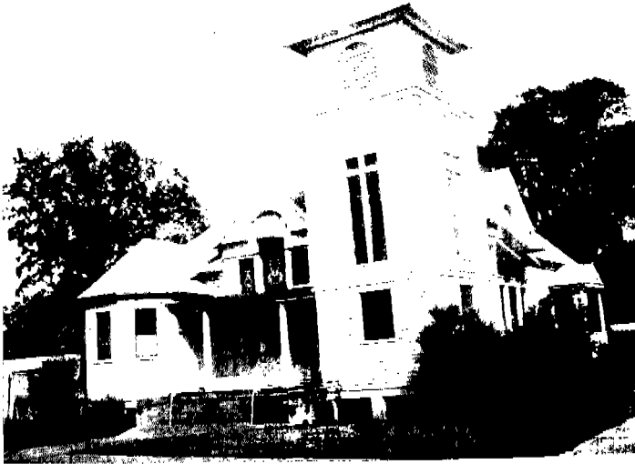
THE 1898 SANCTUARY OF THE FIRST BAPTIST CHURCH