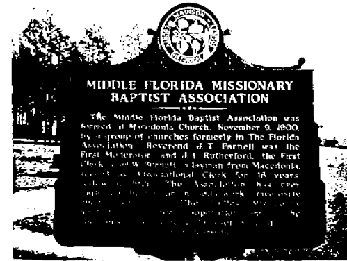
HISTORICAL MARKER AT MACEDONIA