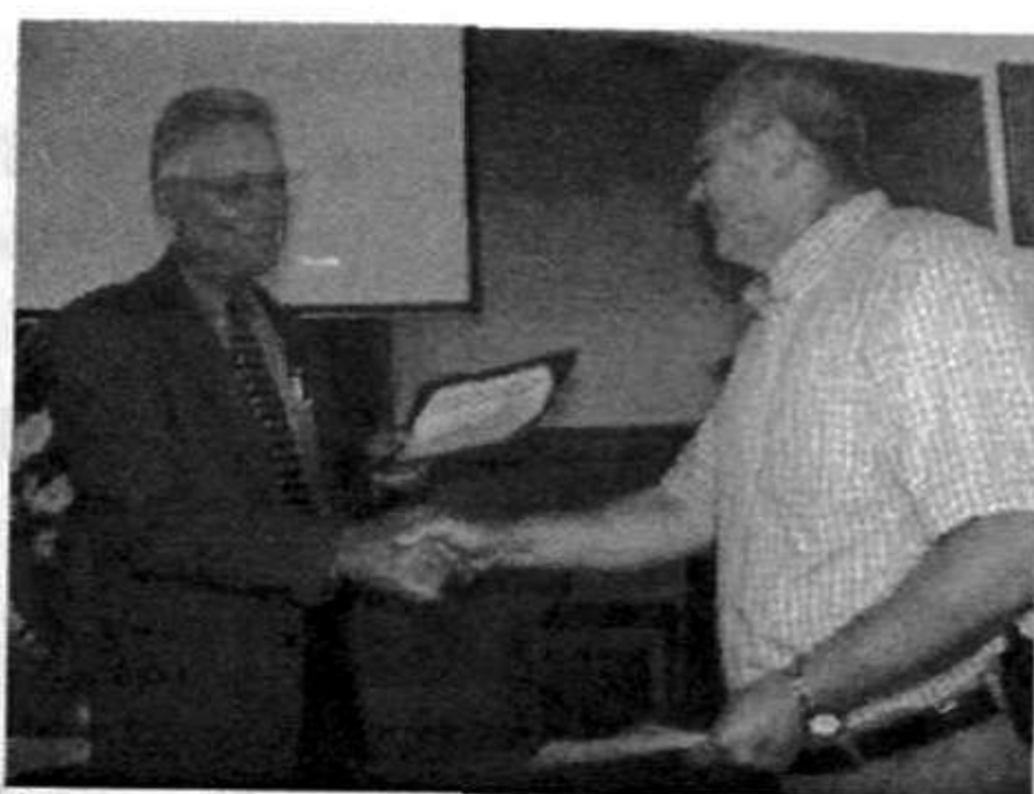
The Olive Church was recognized for the largest gift and largest per capita gift to the Lottie Moon Christmas from Middle Florida Association.