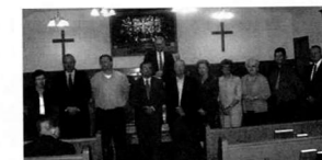
Associational Officers and Directors 2007-2008

The Olive Church was recognized for largest gift and largest per capita gift from Middle Florida Association to the Lottie Moon Christmas Offering.