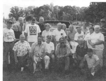
Twenty two (22) people representing eight churches served on mission in the Covington Association, Andalusia, Alabama May 17-21, 2004