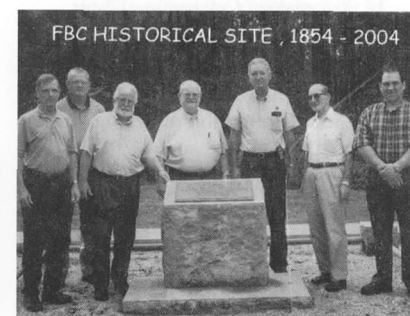
The Florida Baptist Convention was organized November 20, 1854 near Concord Church. Ministers standing at the monument. On November 20, 2004, 150 years later we return to the Clifton Mansion site for celebration and praise.