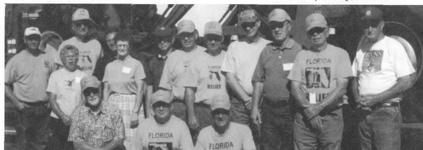
September 22-25, 2004, Disaster Relief Cleanup and Recovery work in Milton by seventeen responders after Hurricane Ivan.