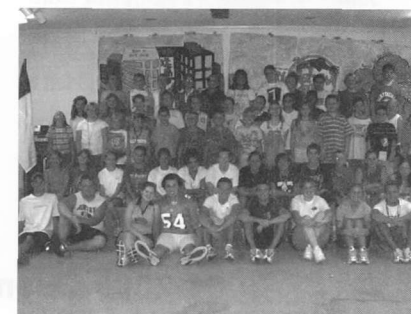
Sports Camp at Lee School July 26-30, 2004. Thirteen members of Southside Baptist Church, Jacksonville served as staff. Twenty seven Middle Florida served in the Day Camp.