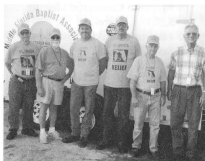
August 20-24, 2004 Disaster Relief Cleanup and Recovery work done by nine responders in Arcadia after Hurricane Charley. August 26-30, 2004 Disaster Relief Feeding Unit work done by nine responders in North Port and Punta Gorda after Hurricane Charley.