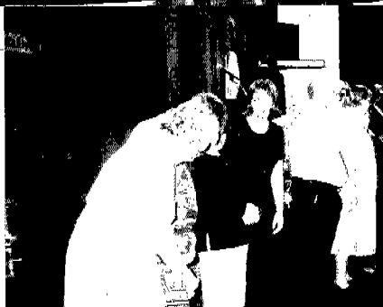
Members of Harmony Baptist Church being welcomed into the Association October 16, 2000.