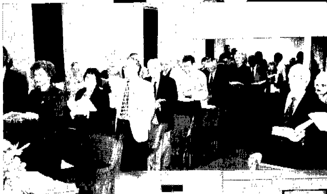
Mayo Baptist Church, October 17, 2000, the messengers singing "How Great Thou Art."