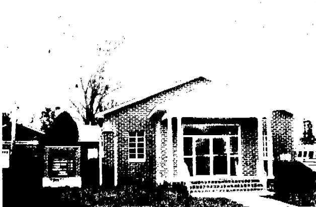
Color contrast being absent on the steeple against the sky, this beautiful part of the Church does not show in picture.

We are proud to be the first and second place church in the Florida State Baptist Convention percentage wise in World Missions through the Cooperative Program.