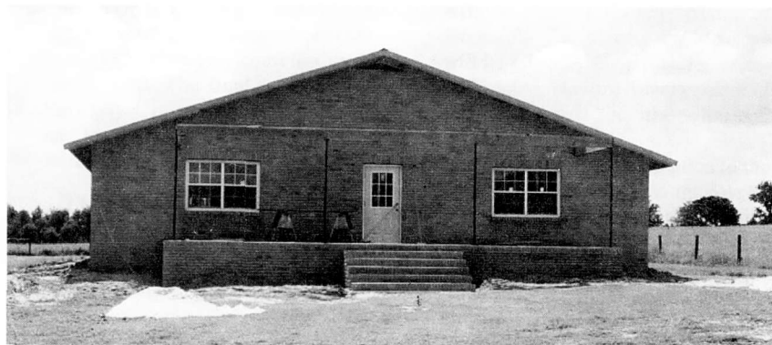
Construction began June 1, 2001 on new Association Office located at 1902 Country Clud Rd, Madison.