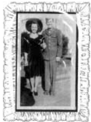
December 17, 1944