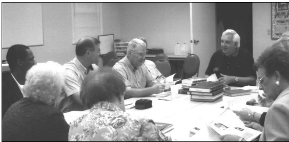
Spring Board Meeting, St. Augustine, April 25, 2008