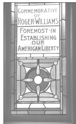
Commemorative stain glass windows located in Ancient City Baptist Church, St. Augustine L to R Adoniram Judson, C. H. Spurgeon, Roger Williams