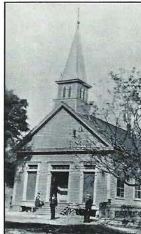
First Baptist Church, Gainesville