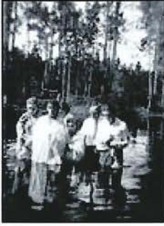
Baptism, Sirmans Baptist Church, Greenville, Florida

How about a baptismal goal for the new year? 70 years ago Florida Baptist churches would often set baptismal goals for the local fellowship. First Baptist Church, Jacksonville set a baptismal goal of 400 for the year 1945. A challenge: We are prayed up. Why not set a local baptismal goal for a statewide evangelistic emphasis? Encourage each church to set a baptismal goal and then pray, plan, work and agonize toward the goal.