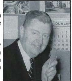
Carl McIntire (1906-2002)

Carl McIntire (1906-2002) had the longest pastoral tenure of any preacher I have read about. McIntire was the controversial Presbyterian preacher who served as pastor of Bible Presbyterian Church in Collingswood, New Jersey (1933-1999) for 66 years. That my friends is a record.