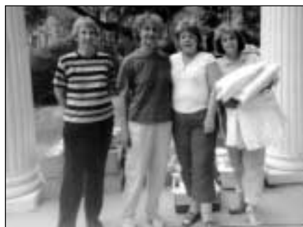
Ladies at Wardlaw-Smith-Goza Mansion who helped serve lunch for 90 people.